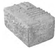
CORNER 7.87" w x 5.9" h x 11.61" d 200mm x 150mm x 295mm