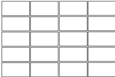
REGULAR & TAPERED BLOCK