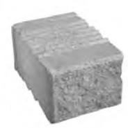
REGULAR & TAPERED BLOCK 7.87" w x 5.9" h x 11.61" d 200mm x 150mm x 295mm